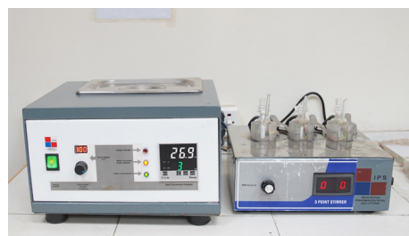
Franz Diffusion Cell Assembly